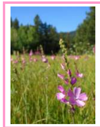
Rose Checker-Mallow- Sidacea virgata

For those unable to attend Mr. Louv's talk Madison Meadow encourages you to read his book, which addresses our children's connection to the natural world. Nature needs children as much as children need nature.