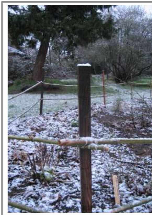
Native plant garden after a February snow

In time, after the plantings become more established and substantial, the Meadow board plans to remove the fence. Until then it's a reminder to visitors that the garden needs a little protection.