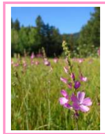
Rose Checker-Mallow- Sildacea virgata

For those unable to attend Mr. Louv's talk Madison Meadow encourages you to read his book, which addresses our children's connection to the natural world. Nature needs children as much as children need nature.